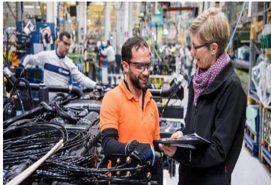
Respect for the individual